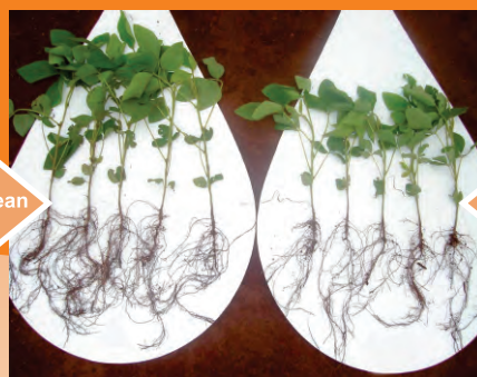
Plant with standard treatment